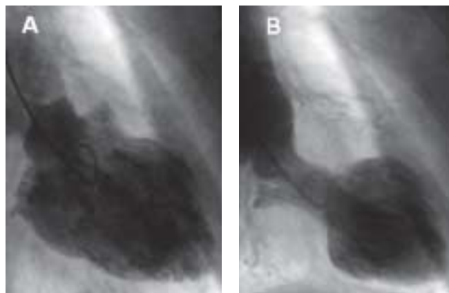
Figure 1. Ventriculography in A: diastole and B: end-systole. Akinesia of the midventricular or apical left ventricular segments and hyperkinesis of basal segments leading to an end-systolic left ventricular "takotsubo" configuration.

The clinical characteristics of the patients are presented in Table 1. The study population comprises six females and one male (mean age of 70, range 53-81 years). All females were in the postmenopausal age. Five patients had emotional or physical stress associated