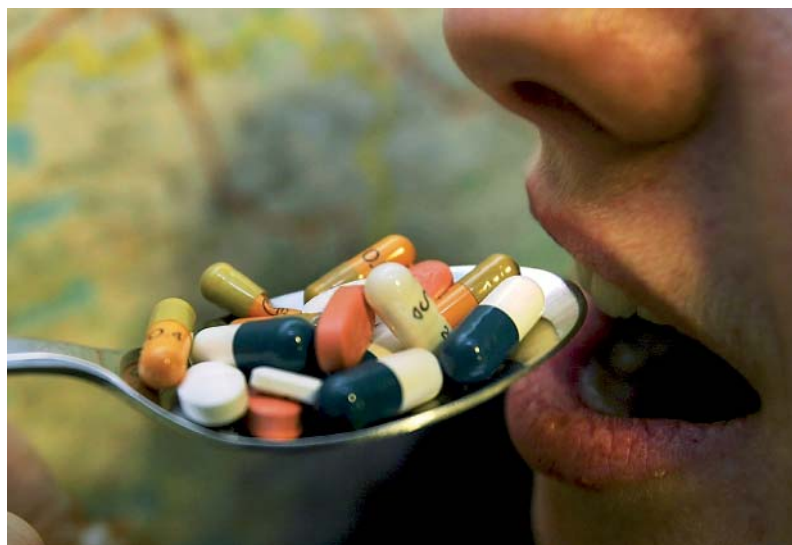
Many polypharmacy patients are treated with drugs which are no longer indicated.

PP is often associated with treatment of concomitant chronic diseases, providing indication for medical treatment with several drugs for each disease [12] and PP is therefore frequently indicated. However, PP is associated with an increased risk of adverse drug reactions [6] that rises exponentially with the number of concomitant drugs used [13], and interactions may blur the intended effects of the drugs on the disease.