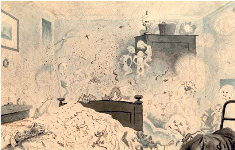
Delerium tremens. The image was made by a 45-year-old male in 1919 whose psychiatrist had invited him to illustrate any hallucinations experienced during a delirium tremens period. The image was kindly made available to Ugeskrift for Læger by Medicinsk Museion, University of Copenhagen.

(Table 2). Thus four patients had obstruction of the airways, while one patient had a continuous depression of the respiratory frequency (9-11 breaths per minute during sleep) following a cumulated 13.400 mg dose of phenobarbital administered over the course of a 20-day period.