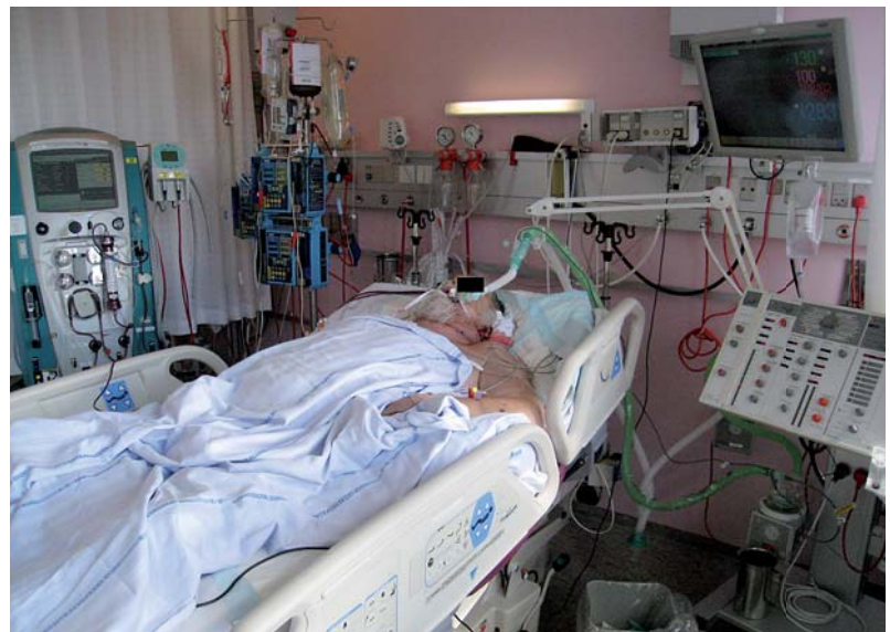
Elderly patient at the intensive care unit.

The strengths of this study are that we had well-defined groups of patients and data from electronic databases and national registries in which data had been entered prospectively. Furthermore, we obtained full follow-up for all patients, the inclusion rate was high (97%), data