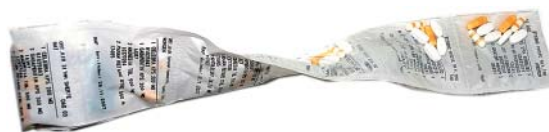
Multi-dose drug dispensing.

Table 2 presents the results of the audit. Information on MDDD was recorded in the physician case record for 3.4% of patients and in the nurse case record for 12.9% of the patients. Delivery of MDDD to the patient's home was actively stopped during hospitalization for 1.1% (95% CI: 0.4-3.3%) of the patients. Changes in