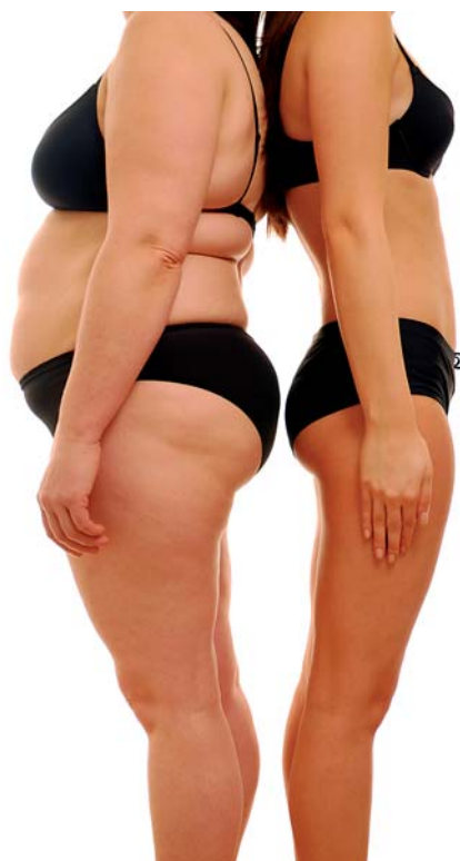
East versus west? There is a geographical diversity in the development of body mass index in Denmark.