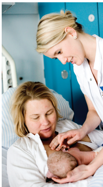
Lactation education provided for the mother of a neonate.

towards increased domperidone use may also be caused by an apparent effectiveness of the drug witnessed by clinicians. There is a large study on domperidone underway that is expected to be concluded in 2015 [13].