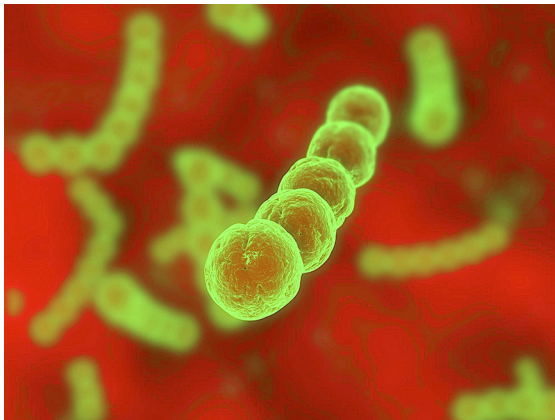
Haemolytic group B streptococci.

GBS bacteriuria in pregnant women is a marker for heavy colonisation and an increased risk of EOGBS [10]. This emphasises the importance of detecting GBS in pregnancy in order to be able to devise a relevant IAP strategy. Whether or not to screen all pregnant women remains a controversial issue, but since the Centre for Disease Control (CDC) and the American College of Obstetricians and Gynecologists (ACOG) introduced a national screening programme in 1996, the prevalence of EOGBS has declined substantially in the US [10]. By 2008, the incidence diminished from 1.5-1.7 cases per 1,000 live births to 0.34, i.e. a decrease of more than 80% [4]. Routine screening has now been introduced in Australia, Spain, Italy, Belgium and Germany [19]. The efficacy of a vaginal screening regime significantly reduces the risk of neonatal EOGBS (RR 0.5, 95% CI (0.4-0.6)) [5].