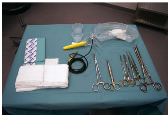
Transanal haemorrhoidal dearterialisation proctoscope with a Doppler probe.

Our study has many limitations. It is a small retro-