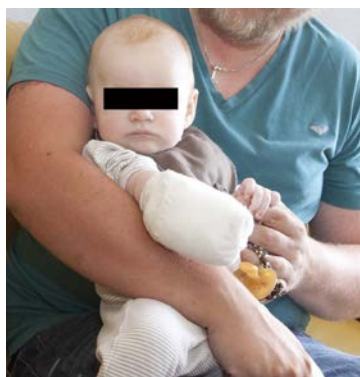
A four-month-old boy who is under treatment for upper urinary tract infection. A follow-up urine sample is not indicated, but if he has symptoms after treatment he must be examined. The parents have accepted that the picture is presented.