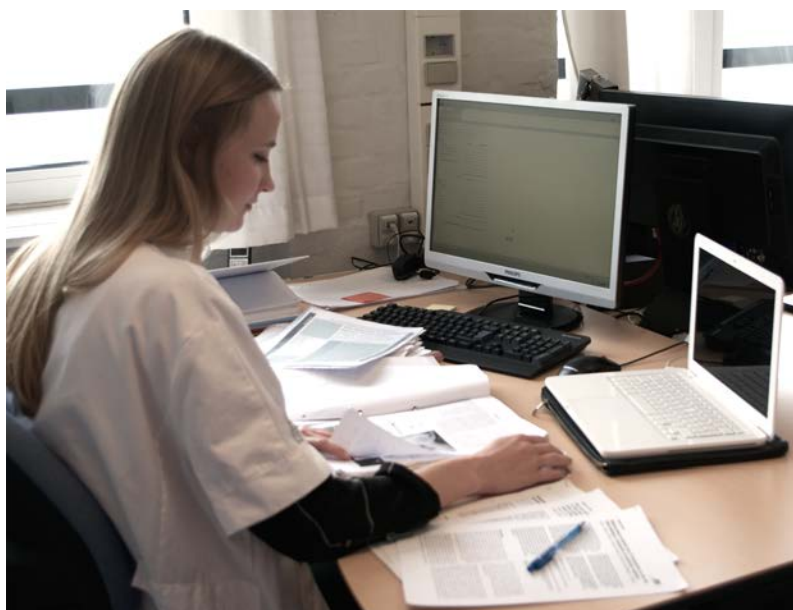
Medical students are increasing their scientific activity and productivity.

continued with research in the context of a PhD programme.