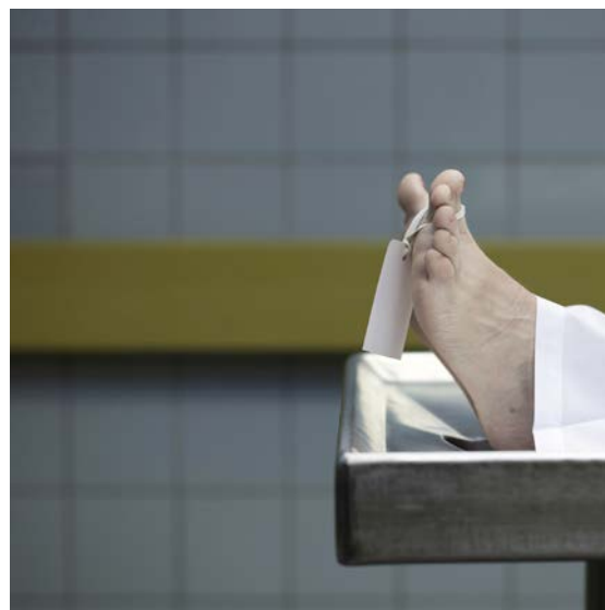
Many deceased drug addicts may have been mentally ill.

The mean age of drug addicts at the time of death has increased over time. Subpopulation 2 shows a significant difference in age at the time of death. This is as-