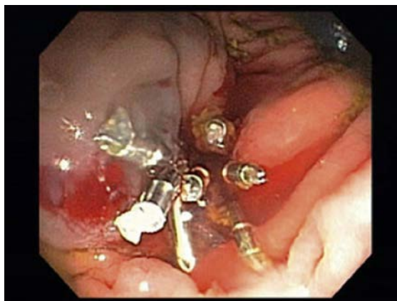
Successful closure of a rectum perforation with endoscopic clips.

the mucosa and submucosa, but they rarely obtain grip on deep layers of the gut such as the muscularis propria and serosa due to their relatively superficial effect. The OTSC consists of a transparent hood on which a strong metal clip is mounted. By suction of the tissue inside the hood, and assisted by a twin grasper, the clip is released [4, 13]. Gubler et al [34] and Voermans et al [33] advocate the use of OTSC for larger perforations owing to its better tissue grip and apposition of the sub mucosal layers. This latter point is of importance as evaluation of a complete clip closure can be difficult at the site. Cho et al [38] discussed the matter after having three cases where insufficient clip closure caused delayed and a need for more aggressive surgery. Based on the literature, the European Society of Gastrointestinal Endoscopy (ESGE) recommends use of the OTSC for larger perforations and the TriClip for smaller perforations [45].