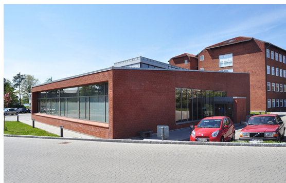
The Emergency Department, Nykøbing Falster Hospital.

There is always a risk of bias in studies relying on retrospective journal material, and we expect that this has an effect on our results. Improper record keeping can entail discrepancies between the treatment given and what is actually recorded. During the first weeks of the implementation process, nurses used checklists to ensure proper implementation. These checklists showed that 90% of patients had lactate measured promptly after admission, a percentage that could not be found during the journal audit completed only a few weeks later. Nonetheless, this study design has the advantage of being relatively easy to utilize in a clinical setting.