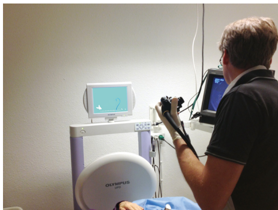
Colonoscopy with magnet endoguide connected.

Furthermore, we confirm an old prejudice as we