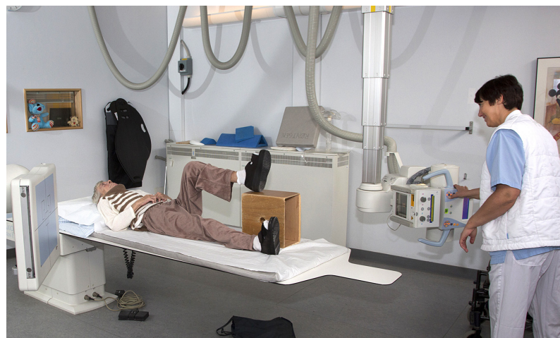
Radiographic examination of the hip.