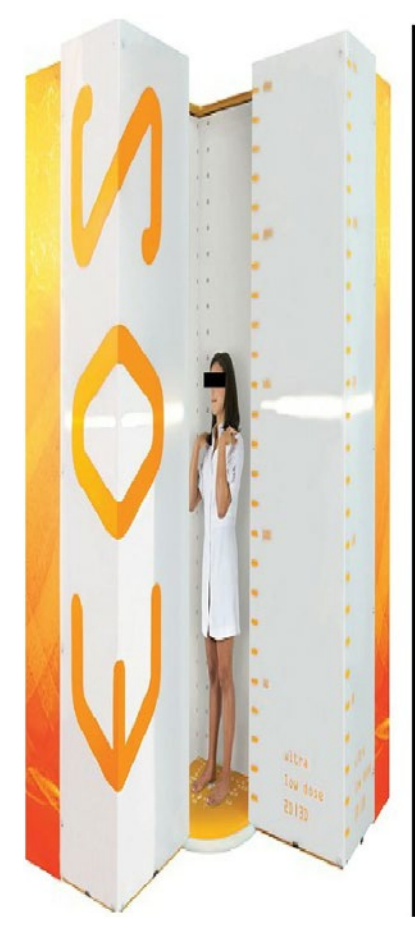
FIGURE 1 / Illustration of the EOS low-dose scanner and the outcome.