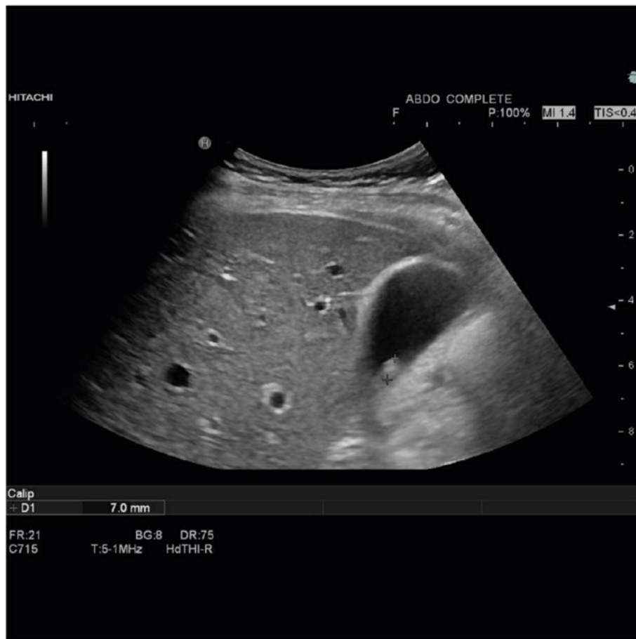
FIGURE 2 / Ultrasonography of an echogenic gallbladder polyp approximately 7 mm in size adherent to the gallbladder wall without acoustic shadowing. No gallstone was detected.