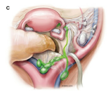
C: Less common SLN drainage and location. If the lymphatic trunks are following the mesoureter look for the SLN in the common iliac presacral region.

Reproduced with permission. ©2008/2013 Memorial Sloan Kettering Cancer Center.