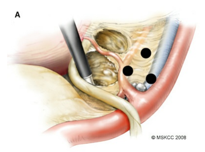
A: Most common sites of involved nodes in women with cervical and endometrial cancer.