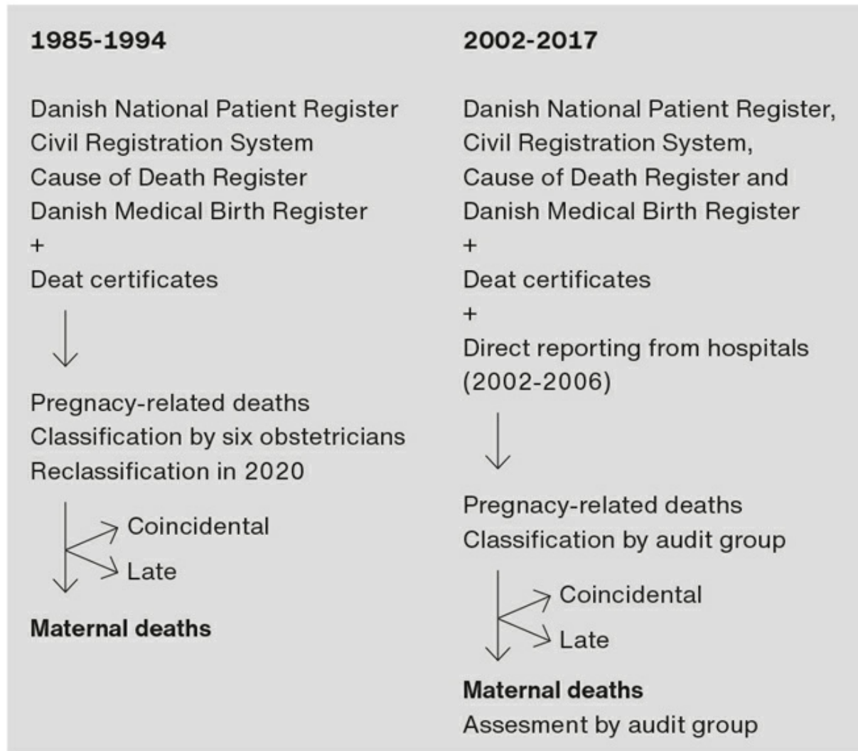
FIGURE 1 Methods and databases used to obtain data on maternal deaths for 1985-1994 and for 2002-2017.

We identified deaths by linking four Danish national registers: the Danish National Patient Register, the Civil Registration System, the Cause of Death Register and the Danish Medical Birth Register. In both periods, register data were combined with data from death certificates. For 2002-2007, this was compared with direct reporting from hospitals. All women who died and had an ICD-10 code in the D000-D099 or DZ32-DZ399 range were identified, and primary and secondary ICD-10 codes and causes of death were then extracted from the Danish National Patient Register and the Cause of Death Register. If, based on register data or direct reports, a death was suspected to be maternal and occurred within 42 days after a pregnancy (in accordance with the international definition) we requested full medical records from hospitals and from family doctors, if needed.